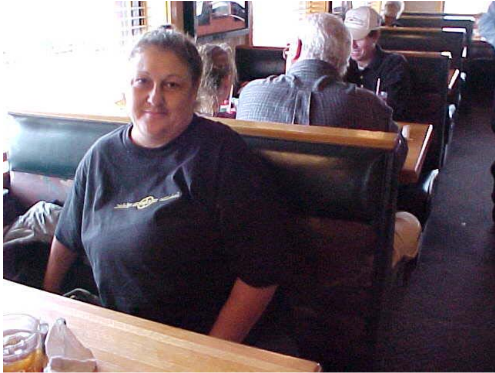
Eldest Daughter Mili