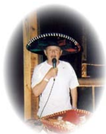
My Singing debut in Mexico City. I thought I sounded great. March 2008.

I was in San Antonio, Lackland AFB, TX from 1969 – 1975. I was then reassigned to Luke AFB, Glendale, AZ. I was assigned to the 4444 th Operations Squadron. In 1977 I was getting ready to put in my retirement papers. I was called in to the squadron commander's office. He informed me that I had just received an assignment to Saudi Arabia. The only way I could keep from not going there was to extend my enlistment for two years and take a three year assignment to the Panama Canal Zone. I would be able to take the family. I was more than happy to take that assignment. After that, I was again assigned to Luke AFB, where I retired after 23 years. The three years in Panama were in my estimation the best years of my 23 years in the Air Force. After retiring from the Air Force, I went to work for the City of Glendale, AZ. I retired from there in 2001.