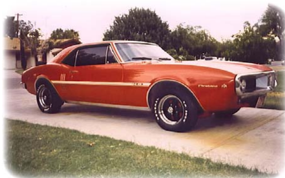
Our 1967 HO Firebird. In process of being restored.