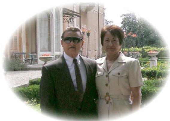
Trip to Italy